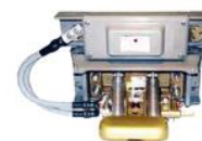
3 rd rail collector