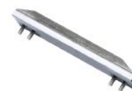
3 rd rail shoe