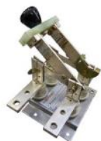
Power isolating switches