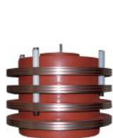
Slip ring assemblies