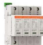
Surge Protective Device (SPD)